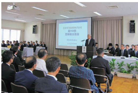
Ordinary General Shareholders' Meeting in 2010.

Each June, we hold our Ordinary General Shareholders' Meeting, at which we explain the business results of the previous year to our shareholders, who then vote on the matters to be resolved. The stock distribution of NGK Spark Plug Co., Ltd. is shown in the pie-chart below.