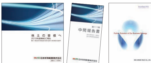
To All Our Shareholders (Japanese only)

http://www.ngkntk.co.jp/english/ir/index.html