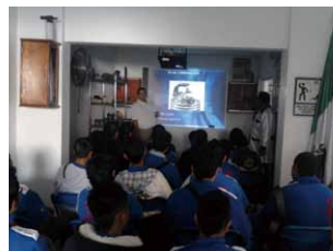
Seminar at a mechanics training school

Bujias NGK de Mexico S.A. de C.V. holds seminars on spark plugs and sensors at local training schools for mechanics. During fiscal 2011, a total of 6 seminars were held at four schools, in which 560 students participated as future mechanics.