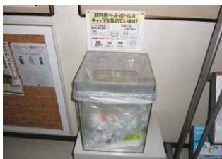
Cap collection box installed at our cafeteria

Since July 2010, we have been participating in the movement for providing vaccines to children in developing countries, through collecting plastic bottle caps and donating them to NPO for children's vaccines. During fiscal 2011, we donated a total of 386,000 caps which would enable 483 children to take polio vaccine.