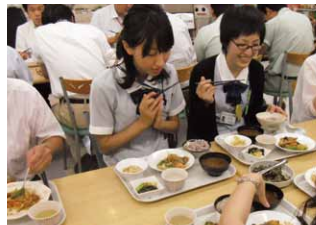
"Healthy choice" meal