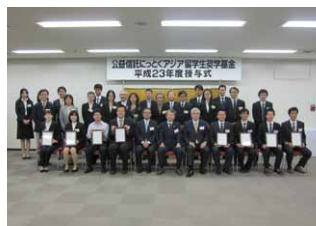
Scholarship granting ceremony

Nittoku Asia Foreign Student Scholarship Public Trust is a charitable trust that we established in November 2006 to commemorate our 70th anniversary of the foundation. This Fund targets Asian students studying in the Aichi Prefecture. In its fifth year (fiscal 2011), the Fund granted scholarships to 9 students.