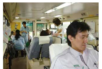
Employees of NTK Ceramic Co., Ltd. are donating blood.