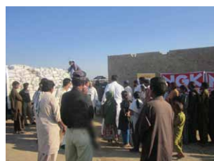
Distribution of backup supplies

In summer of 2011, about 9 million Pakistanis (according to the government) were affected by massive floods. NGK Spark Plug Middle East FZE distributed about 700 bags of rice, soy beans, sugar, blankets and other backup supplies to affected people in Sindh, a province in the southern part of the country that was affected severely.