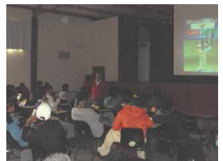
Seminar at a mechanics training school