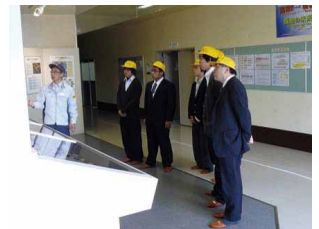
Visitors to our plant (NTK Ceramic Co., Ltd.)