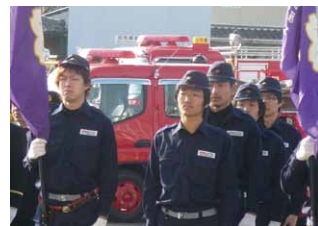
In-house fire-fighting team of the Komaki Plant

We are prepared for an immediate response, in the event of any major disaster, to provide support for local communities. Our headquarters have entered into a memorandum of agreement with the Mitsurugi School District in Mizuho-ku, Nagoya City for the provision of our materials and equipment at the time of emergency. Also, our Komaki Plant has concluded an agreement with Komaki City for the dispatch of our fire engine and in-house fire-fighting team to respond to any major disaster in the region.