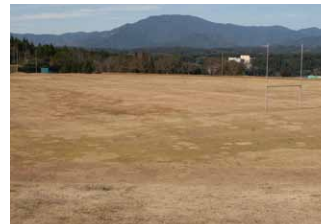
Our athletic field designated as a heliport

In December 2011, Kagoshima Prefecture started to use medical helicopters for lifesaving operations. Miyanojo Plant athletic field has been designated as a heliport for medical missions, contributing to local society in securing a base for lifesaving operations.