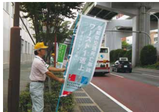
Campaign at Nagoya Plant

As a company engaged in the auto industry, we are socially responsible for ensuring traffic safety. We conduct a traffic safety campaign on a regular basis, in which we use signboards and banners and call out to pedestrians on the street, including local citizens and our employees, to raise the level of their attitude toward traffic safety.