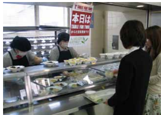
TFT (Table for Two) Day

Since October 2011, Headquarters and Nagoya Plant have been involved in TABLE FOR TWO, a program providing school lunches in developing countries. For each "healthy choice" meal served in the cafeteria, 20 yen is donated. Accumulated donations were equivalent to 11,923 school lunches by March 2012. The Komaki Plant and the Ise Plant have participated in the TABLE FOR TWO program since April 2012.