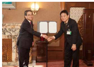
Ceremony for the official appointment of a naming rights partner