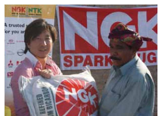
Distribution of backup supplies