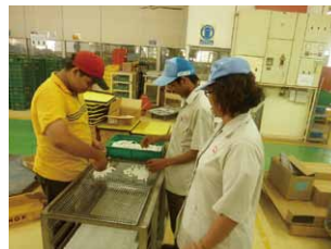
Hands-on work experience at a plant (NGK Spark Plugs Malaysia Berhad)

Our group companies provide local junior high and high schools with hands-on work experience and training opportunities on demand, and also accept visitors to their plant facilities.