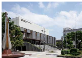
Nagoya Citizens Auditorium

NGK SPARK PLUG CO., LTD. was selected as naming rights partner for Nagoya Citizens Auditorium, a major cultural facility in Nagoya. Accordingly, the hall's name has been NTK Hall since July 2012. Taking this opportunity, we will further contribute to cultural and artistic development with a view to vitalization of the local community.