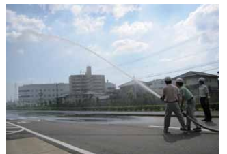
Water spray drill