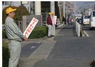
Campaign at Komaki Plant