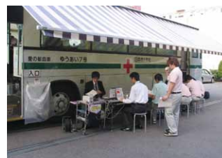
Our employees register at the reception for blood donation (Headquarters and Nagoya Plant)

In cooperation with blood centers of the Japan Red Cross, we encourage our employees to volunteer to donate blood, by holding blood donation events on a regular basis. During fiscal 2011, NGK SPARK PLUG's blood donation events were held four times at four of our plants. In addition, volunteers from our affiliates inside and outside the country, including NTK Ceramic Co., Ltd., Tono Ceramic Co., Ltd. and P.T. NGK Busi Indonesia, also donated blood.