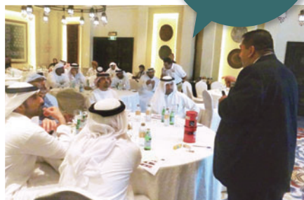
A seminar for the controlling authorities (UAE)

Participating in a counterfeit good eradication seminar in the UAE