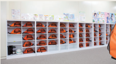
Survival kits at the workplace

In April 2014, we distributed survival kits, which are essential disaster prevention items, to NGK SPARK PLUG Group employees in Japan. The contents of the kits include a helmet, emergency food and water, work gloves, a mask and other items. These will be essential items for employees in a large-scale disaster. As much as possible, employees keep the kits close at hand to take with them immediately in the event of an emergency evacuation.