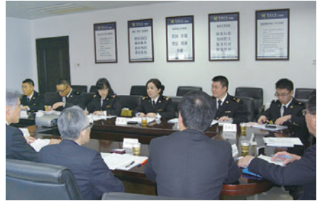
Exchange of views with customs officials

Counterfeit NGK SPARK PLUG goods are spreading, mainly in emerging nations. To ensure the safety of users and protect our corporate brand, we are working in cooperation with police and customs officials in various countries to expose counterfeiters and destroy counterfeit goods. We will also proactively participate in educational activities to stamp out counterfeit goods in cooperation with government bodies and industry organizations.