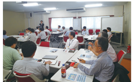
Seminar for divisional compliance promotion staff

To reinforce employee awareness of compliance, we have been continuing to conduct workplace training based on conventional seminars aimed at different levels of the corporate structure, the Compliance Guidebook, and Compliance Newsletter. In fiscal 2014, we also ran seminars with external lecturers aimed at officers and divisional compliance promotion staff to encourage education and awareness-raising in all divisions and Group companies.