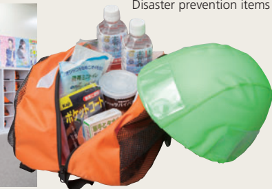
Disaster prevention items