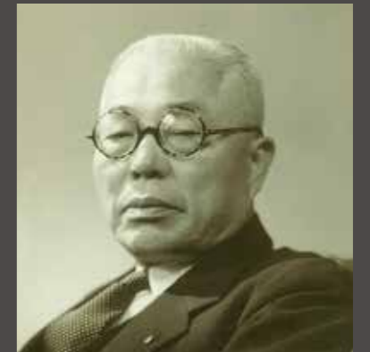
Magoemon Ezoe (First president of NGK SPARK PLUG)

As our business evolved from tableware to industrial products, we faced even stricter demands for product uniformity. In order to constantly realize the performance need by customers and to eliminate discrepancy among products, Magoemon Ezoe expected a high level of discipline and sense of participation to produce quality products. Employees at all workplaces devoted themselves to manufacturing which fulfilled such expectations. Even today, the philosophy of producing quality products with participation by all employees is still alive at NGK SPARK PLUG.